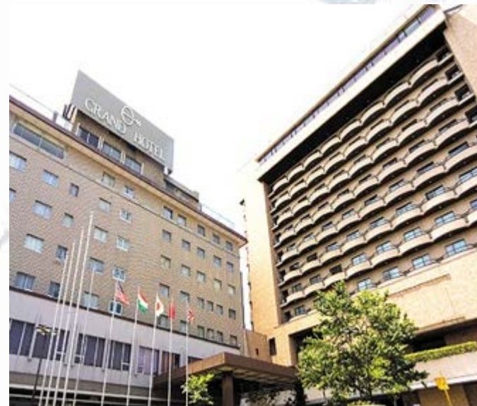
GRAND HOTEL HAMAMATSU