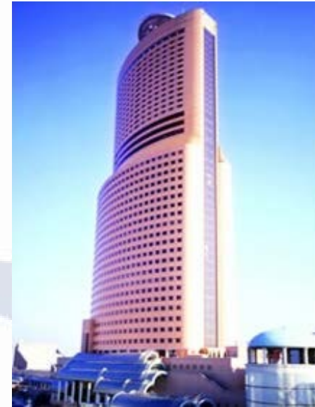
Okura Act City Hotel Hamamatsu