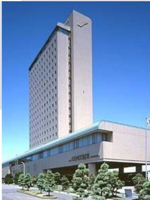
Hotel CONCORDE Hamamatsu